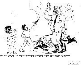
Click for full size picture. (12K)